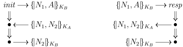
Figure 3.1: Needham-Schroeder Initiator and Responder Roles